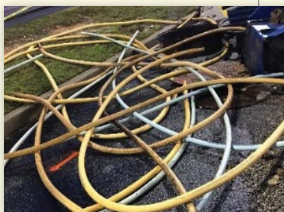
Removed Failed Flexible Fuel Piping