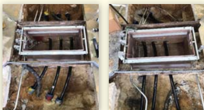
DoubleTrac® running through new UDCs

DoubleTrac® is unique in its ability to easily pull through existing chase pipes. DoubleTrac is lightweight (1.5" is only 1.5 pounds per linear foot). DoubleTrac® is flexible, yet the corrugated stainless-steel primary does not hold a memory. It does not curl up once unreeled. And it is durable. DoubleTrac does not kink even when navigating tough turns underground.