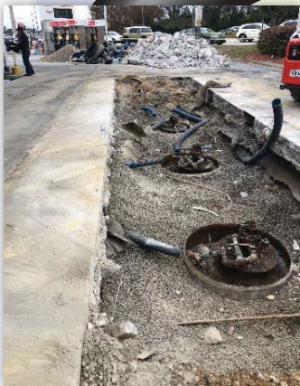
Exposed Tank Field with old flexible fuel piping removed